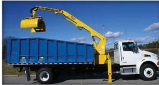
Model shown with additional options

Heavy Duty 30" Diameter Slewing Ring Bearing