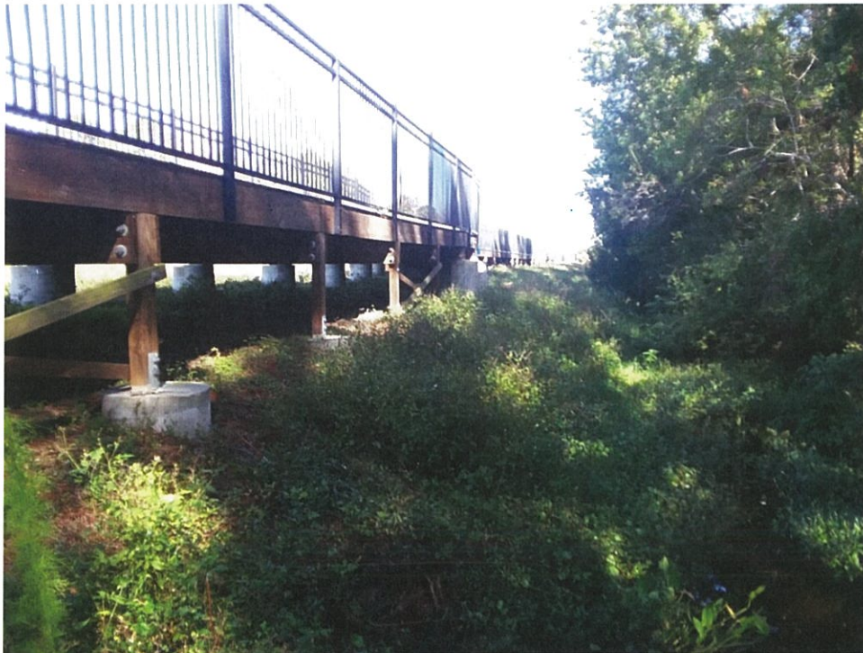
Photograph 1 – Existing Conditions/Boardwalk at Belle Terre Parkway

Photograph 1 shows the existing conditions, and Figure 1 (Attachment 1) provides a graphic representation of the proposed project.